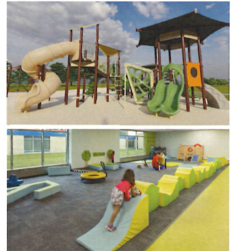
Above: A rendering of proposed playground improvements at Eagle View Elementary and an example of a large motor space for early childhood education.